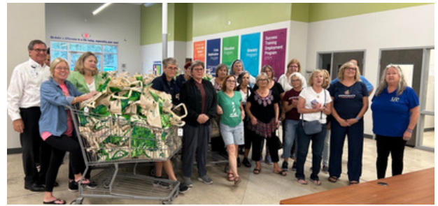
Volunteers packed Thanksgiving meals for Hopeful Harvest event