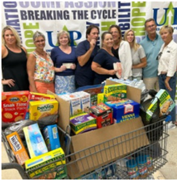
Community Food Drive for Emergency Pantry

More information on volunteer opportunities is available on the website.